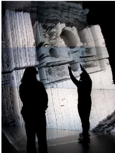
LANL scientists working in our CAVE advanced visualization facility.

Finally, teams present their accomplishments as a poster and technical talk to Laboratory management, staff, and fellow interns in an end-of-summer celebration of intern work.