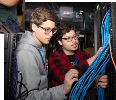
Interns cabling their mini-supercomputer.

“[T]he connections I made this summer will be beneficial moving forward, both career-wise and as lasting friendships once the internship is over.” — 2019 intern