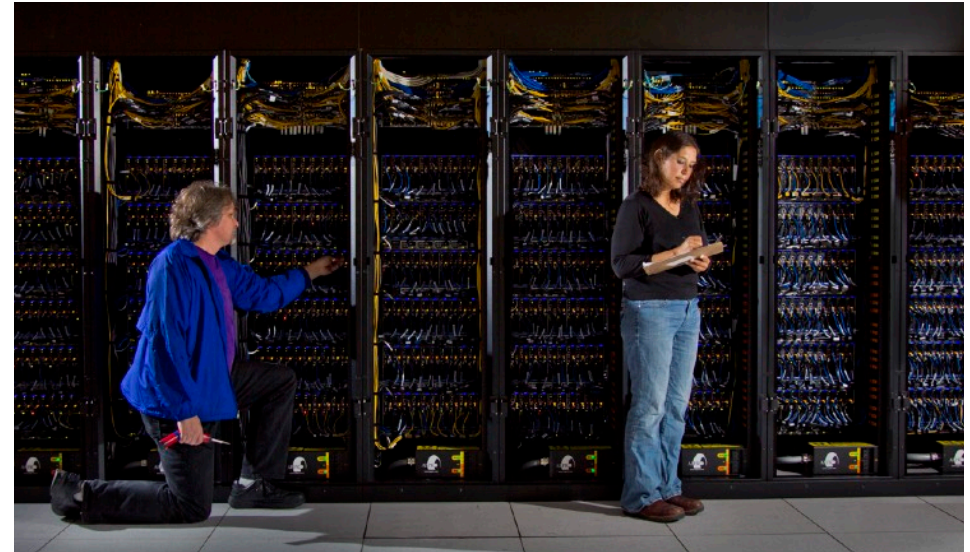
High Performance Computing Division staff working on a supercomputer called Luna.

Utilizing the Elastic Stack for modular metric aggregation to enable user-accessible cluster monitoring