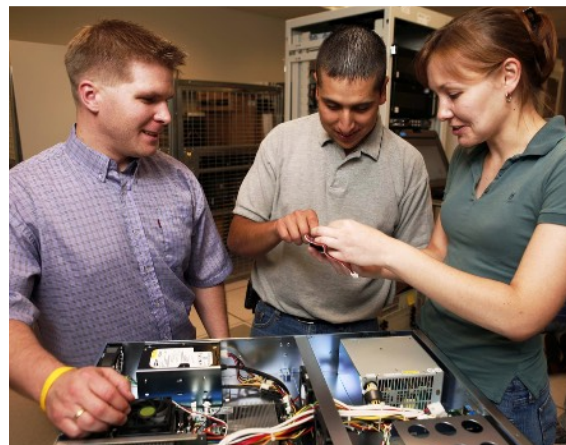
Instructor (left) and intern diagnosing compute node hardware.

Technical summer program offering hands-on experience building and operating state-of-the-art and next-generation compute clusters, high-speed networks, extreme-scale filesystems, containers, security, and more.