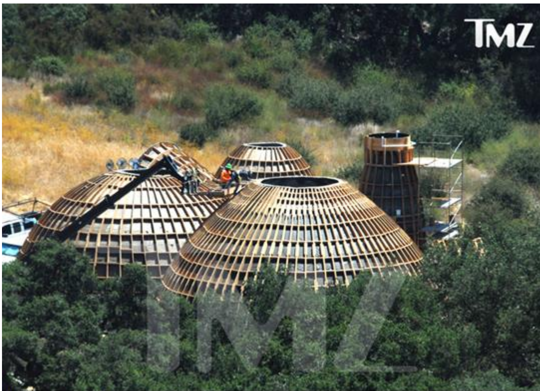
West has modelled the homes on residences featured in the Star Wars films.

U.S. rapper Kanye West revealed his revamped housing prototypes in Calabasas, Calif. The original prefabricated structures were deemed to be in violation of the building code by Los Angeles County Department of Works inspectors and were demolished.