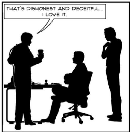
© 2016 ARCHITECTS.LOL ALL RIGHTS RESERVED