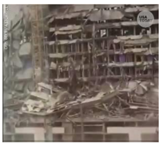
USAToday article excerpt:

One lawsuit, filed by attorney Rene Rocha of the law firm Morgan & Morgan, does make a number of specific allegations, including that structural supports were not strong enough to support the concrete in the upper floors, the use of unskilled labor, and not allowing time for concrete to cure fully.