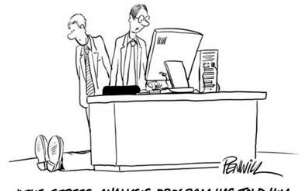
"THE STRESS ANALYSIS PROGRAM HAS TOLD HIM TO LIE DOWN FOR A WHILE "

Last month's article on this offered VAR requestors use of the new SharePoint site for creation and processing. This is starting to take off, but I'm asking again users to choose this option since we'd really like some more feedback before we replace the familiar 2137 form with this method around the June timeframe. So, please, when a new 2137 is needed, check out a VAR number from the CoE Document Numbering <u>site</u> and then wait a bit for the magic to happen for you.