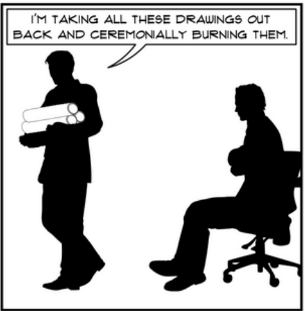
© 2011 ARCHITECTS LOL ALL RIGHTS RESERVED