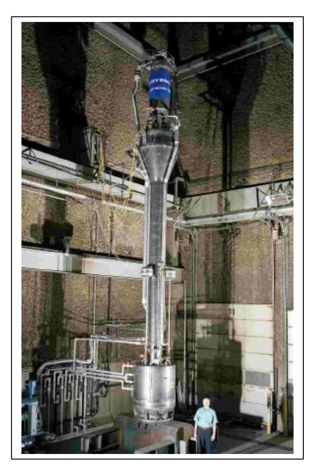
Figure 2. The 500 gpd TASHE-OPTR. The natural gas burner is at the very top. The TASHE is the large bulge below the burner and the OPTRs (not visible) are inside the vacuum jacket hear the bottom.