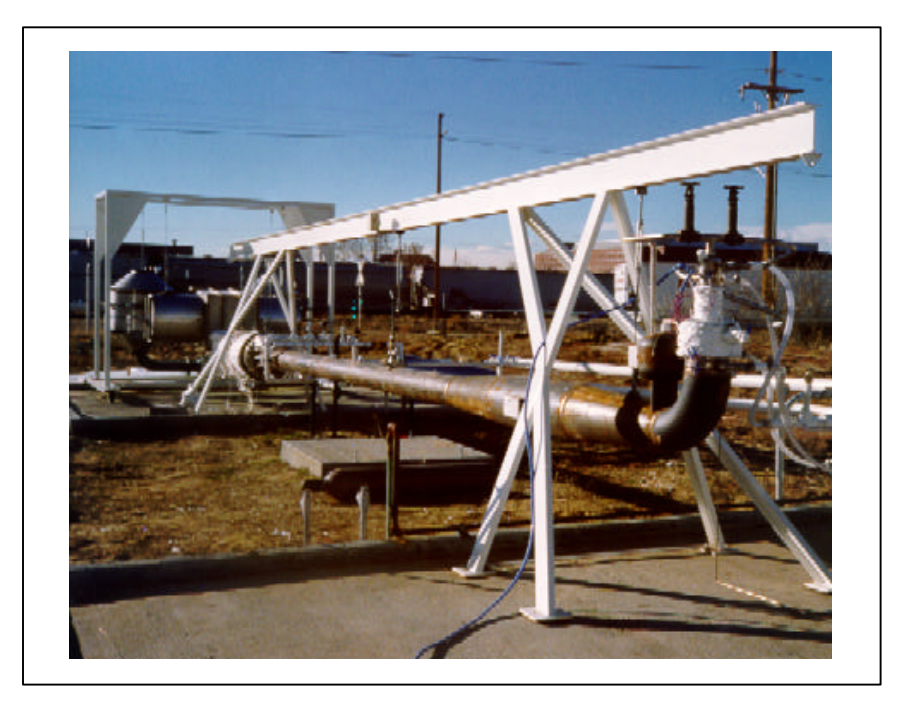
Figure 1. The 140 gpd TADOPTR Prototype

efficiency. A number of engineering issues were identified during that testing and are in the process of being addressed. Full system testing is projected to be completed in 2001