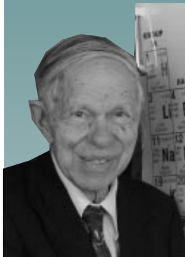
Dr. Glenn Seaborg

The limited chemical identification experiments of Fermi and coworkers seemed consistent with this view. The work of Otto Hahn, Lise Meitner, and Fritz Strassman in Berlin seemed to further confirm it.