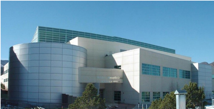
The Strategic Computing Complex (SCC) is a secure supercomputing facility that supports the calculation, modeling, simulation, and visualization of complex nuclear weapons data in support of the Stockpile Stewardship Program.