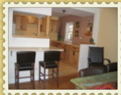
view towards kitchen from dining room