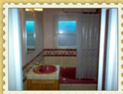
2nd bathroom (shower-Jacuzzi tub)