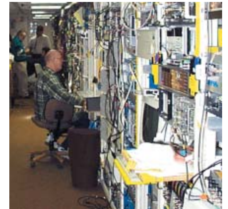
Figure 1. P-22 data-recording trailer at the Nevada Test Site (NTS) U1A underground test facility. The trailer uses modern fiber-optic systems and state-of-the-art digitizers and timing systems to gather and record data from explosive experiments located almost 1,000 ft below ground.

understand primary and secondary weapons-physics issues that are crucial in a world without nuclear testing.