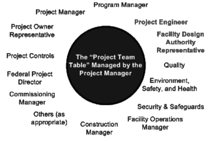
Figure 2. Typical project participants.

1. Typical project participants are depicted in Figure 2.