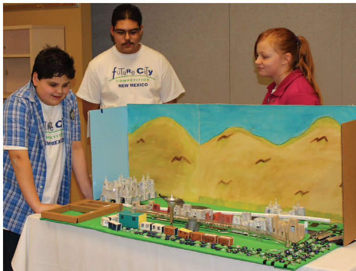
Taos Middle School captured the best presentation award in the Future City Competition.

For more information, go to http://community.lanl.gov